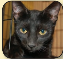
FIG: Fig is a very small 3 year-old female with a beautiful black, sleek coat. If you need a friend to play with, Fig is your girl. She's a real ball of fire who would love to play with you!

ELIZABETH: Elizabeth came to the shelter as a feral stray, so she needs a little time to warm up, and we think she would prefer to be your only cat. Once she knows you, she is very sweet and quiet and is very content to sit in a windowsill looking outdoors. She's approximately 8 years old, a Domestic Shorthair.