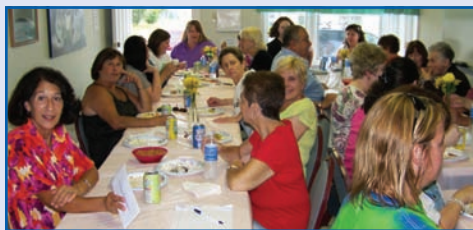
The tables at The Humane Association were crowded with our staff and volunteers as we celebrated their many contributions of time and talent at the Staff and Volunteer Appreciation BBQ.

The fundraiser was held at the dinner after their Captain and Crew tournament was played. Each of the 40 members of the league donated $20.00 to The Humane Association. The money from their 50/50 raffle that night was also donated. Including other private monetary donations, the total amount given to The Humane Association of CNY was $1,200. The women also brought food, blankets and other pet supplies to donate that night, enough to fill an SUV! As if that wasn’t enough, the members of the league unanimously agreed to donate the top raffle prize, a golf bag, to The Humane Association. The golf bag, valued at over $200, was used as a prize in The Humane Association’s silent auction on October 1st. Thank you ladies for helping all the animals at The Humane Association of CNY. Your generosity is greatly appreciated!